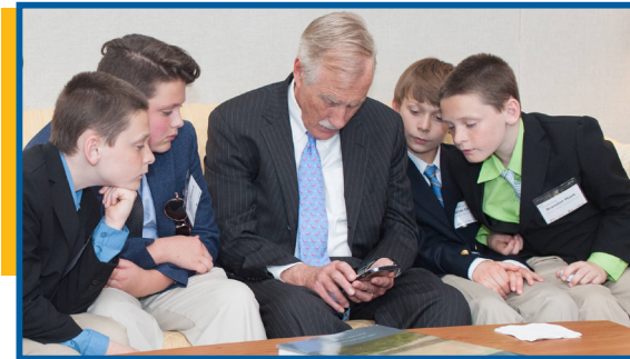
Winning students from Maine strategize with Senator Angus King (I-ME)