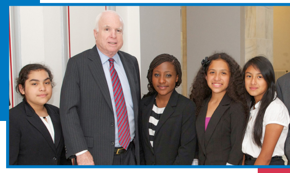
Senator John McCain (R-AZ) with winning students from South Central Middle School