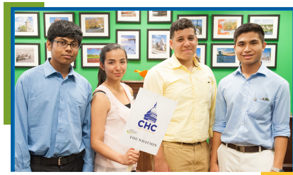
Winning students from Connecticut visit Representative Jim Himes (D-CT)

“One thing is for certain, the Capitol Hill Challenge has drastically altered my perspective on the economy, financial literacy, and even on what I can achieve as I move forward in my life.”